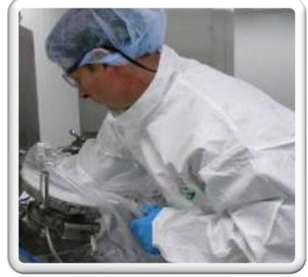
Quick Contained Access