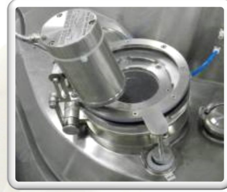
Inspection Lamp & proximity sensor