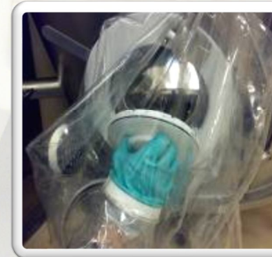
Dust Caps / GMP caps