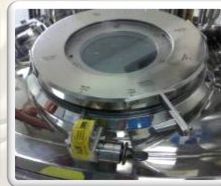
6 Barg & Safety Keylocks