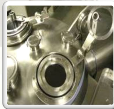
With Key Exchange Interlock